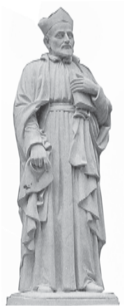
ST.IGNATIUS Our Patron Saint